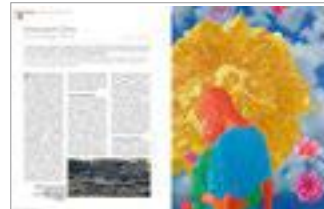
Art & Culture