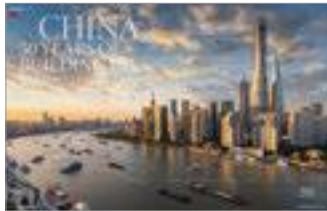
Country Cover Stories