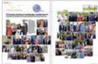
Magazine Presentation & Networking